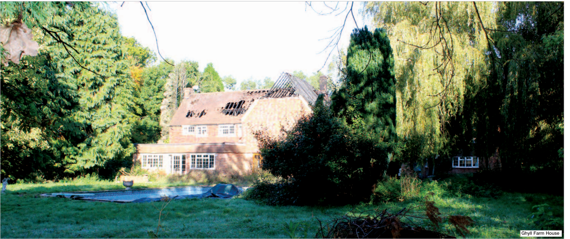
Ghyll Farm House