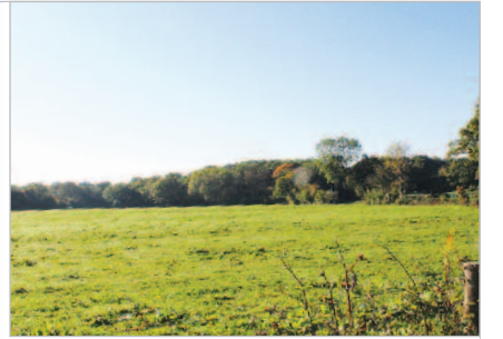
2 The Paddocks