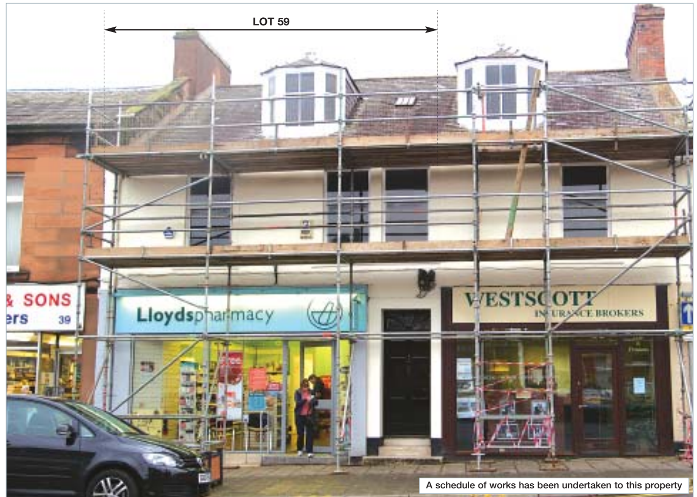
A schedule of works has been undertaken to this property