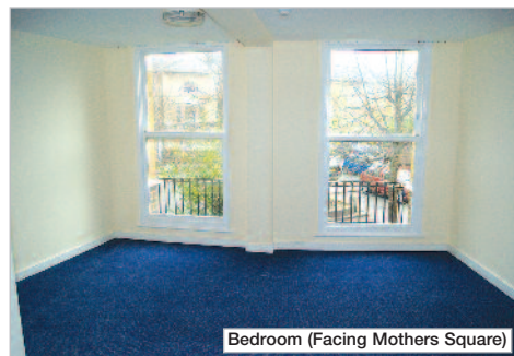
Bedroom (Facing Mothers Square)