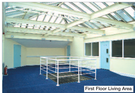
First Floor Living Area