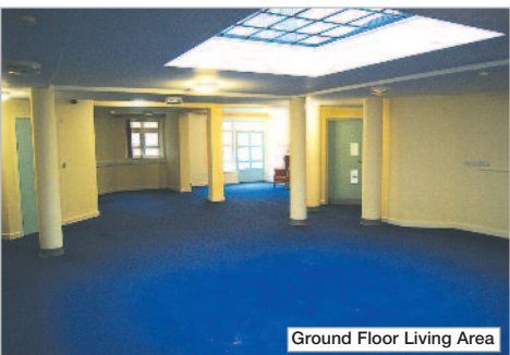
Ground Floor Living Area